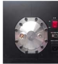
Back View (Power & Controller Port)