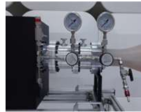
Side View (Gas Control Part)